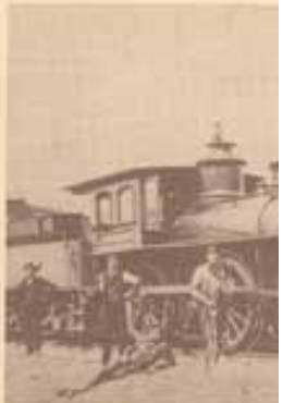
"The train is coming! The cry in 1877 as the first train arrived in Alliston"