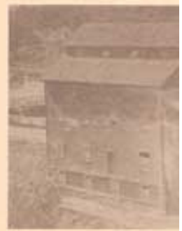
Fletcher's grist mill sat on the Boyne River from 1853 to 1911.

1872 – Wesleyan Methodist Church is erected (became St. John's United Church.)