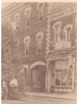
searly Damian's) built by ed a drive through archway ations have been made here ons.