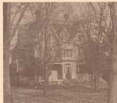
Drury-Hutchinson Home 118 Victoria St. E. dates from 1877-8. Hutchinson was the haberdasher (The Old Stanton Store) demolished in 1987 for an apartment building.