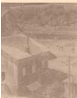
the south bank of the Boyne They bought grain in 1882 own and Alliston.