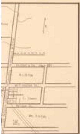
estern Railway map showed '0's to lay the track.