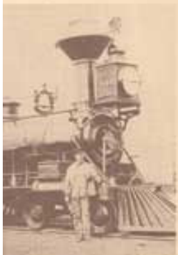
train is coming!", was the n arrived.