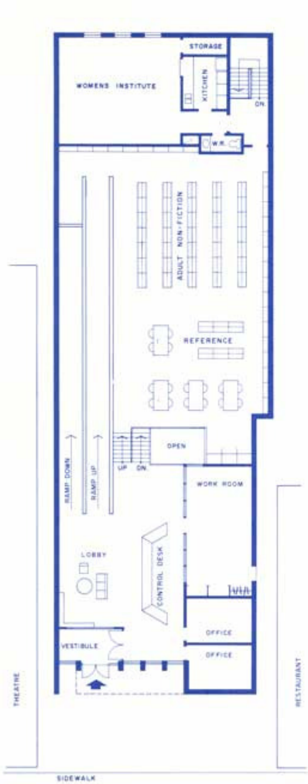
VICTORIA ST. EAST GROUND FLOOR PLAN